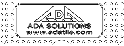
A LOGO DETAIL

DETECTABLE WARNING SURFACE PANEL Iron Dome Secure Flange 24\" x 12\" Plate PART SIZE: 24\" (609.6 MM) X 11.875\" (301.6 MM) 2.40\" (60.96 MM) IN-LINE TRUNCATED DOME SPACING