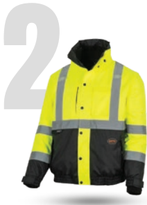
2 HI-VIS JACKET