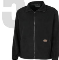
5 FLEECE JACKET