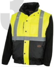
3 HI-VIS VEST + FLEECE JACKET