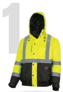
1 HI-VIS JACKET + FLEECE JACKET

DESIGNED FOR DURABILITY BUILT FOR COMFORT