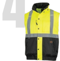
4 HI-VIS VEST