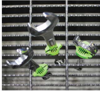
PeakWorks Round Clamps