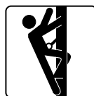
Class L - Ladder