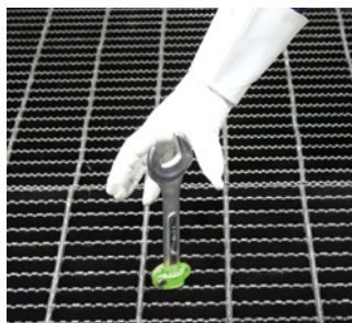
PeakWorks Press Blocks