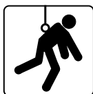
Class A - Fall Arrest