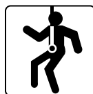
Class D - Descent