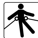
Class P - Work Positioning