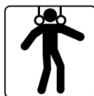
Class E - Limited Access